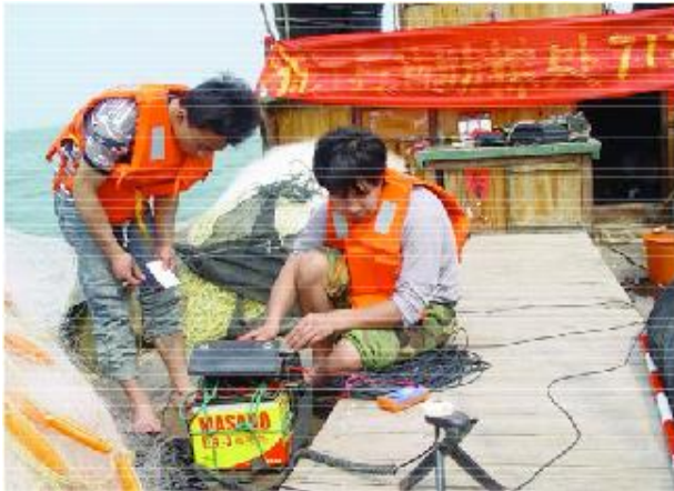
Figure 2. The ZPX crew prepares MT survey equipment on the trawler's deck.

particularity: two gradations of the equipment, with specific mechanical characteristics. That is, equipment for transition zones (depth of 0-50m) and equipment for the shelf (depth of 10-200m). In waters with significant depth fluctuations, it is possible to use the two types of equipment concurrently.