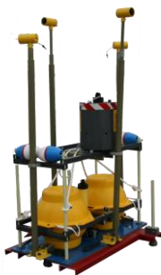
Figure 5. Marine EM receivers for coastal shelf exploration; 2-channel 2AUSS-07A.