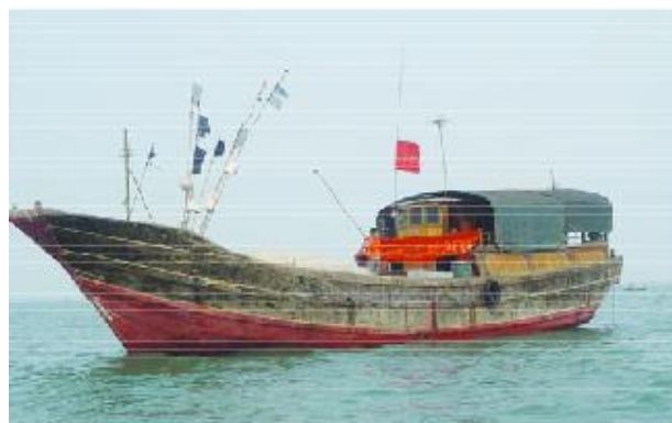
Figure 1. The Chinese fishing trawler that served as the ZPX's "mother ship"; survey equipment was deployed from small motor boat.

Chinese geophysicists in the Gulf of Bohai were the first to experiment in shallow waters with Phoenix equipment, at the beginning of the current century (Marine MT in China with Phoenix equipment, 2004). Work was carried out from a fishing boat (Figure 1) by stretching electrical lines using lifeboats. Despite a positive geological result, this methodology could not withstand serious criticism from the point of view of work safety, accuracy, metrology, productivity, performance and cost (Figure 2).