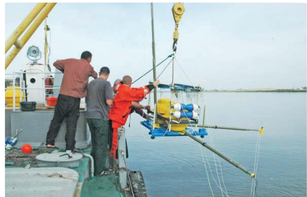
Figure 7. Nord West Ltd. (Moscow, Russia) personnel deploy a shallow-water Marine MT system in the Caspian Sea.

The 5-channel system houses three orthogonal magnetic sensors in custom high pressure enclosures. The sensors are connected to the sphere containing the EM receiver with deep-sea high pressure cables. When requested, the 5-channel system can be built to contain a device to automatically level the magnetic sensors. The system has several options of recovery. Via an acoustic signal received from the surface, the buoy containing the cable ascends to the surface. The cable automatically coils as the buoy ascends. A vessel approaches the surfaced buoy, hooks the cable onto the crane winch, and lifts the system via the cable to the surface of the sea and further via the crane to the deck of the vessel. If, for some reason, the surfacing buoy malfunctions, an acoustic signal is issued to release the concrete block. As the system has positive buoyancy without the concrete anchor, it then ascends to the surface at a moderate rate. Limited dimensions and weight of the system (160 kg 2-channel and 290 kg 5-channel) allow it to be used on relatively small vessels with a crane able to handle 2 tonnes and swing its arm 5 m overboard. The deployment of the system at Caspian Sea is shown Figure 7 (First Marine MT Survey in Russia, 2009).