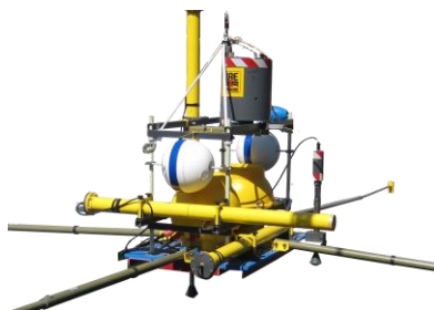
Figure 6. Marine EM receivers for coastal shelf exploration; 5-channel 5AUSS-07A.

The 5-channel system houses three orthogonal magnetic sensors in custom high pressure enclosures. The sensors are connected to the sphere containing the EM receiver with deep-sea high pressure cables. When requested, the 5-channel system can be built to contain a device to automatically level the magnetic sensors. The system has several options of recovery. Via an acoustic signal received from the surface, the buoy containing the cable ascends to the surface. The cable automatically coils as the buoy ascends. A vessel approaches the surfaced buoy, hooks the cable onto the crane winch, and lifts the system via the cable to the surface of the sea and further via the crane to the deck of the vessel. If, for some reason, the surfacing buoy malfunctions, an acoustic signal is issued to release the concrete block. As the system has positive buoyancy without the concrete anchor, it then ascends to the surface at a moderate rate. Limited dimensions and weight of the system (160 kg 2-channel and 290 kg 5-channel) allow it to be used on relatively small vessels with a crane able to handle 2 tonnes and swing its arm 5 m overboard. The deployment of the system at Caspian Sea is shown Figure 7 (First Marine MT Survey in Russia, 2009).