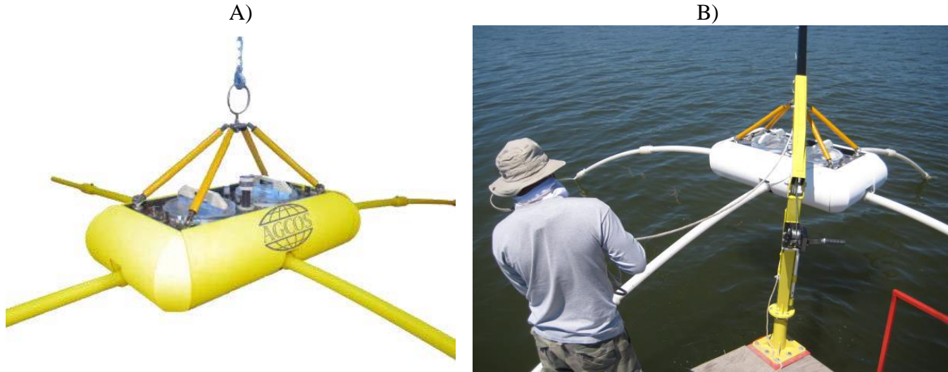
Figure 2: Marine EM receivers for transition zone exploration; A) 2-channel SMMT; B) Deployment of SMMT system during marine EM survey from the pontoon boat.

field recorder and its battery source. The SMMT system has a very low height, provides low aerodynamic resistance, allowing two field crew members to move it effortlessly in its assembled form. The system was tested and showed good functionality with multifunction receivers MTU-2E, MTU-5A Gepard-4A Gepard-8A. The system can thus be used with conventional land EM field receivers produced by various geophysical companies.