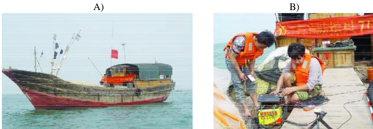
Figure 1: A) The Chinese fishing trawler that served as the ZPX’s “mother ship”; survey equipment was deployed from small motor boat; B) The ZPX crew prepares MT survey equipment on the trawler’s deck.

criticism from the point of view of work safety, accuracy, metrology, productivity, performance and cost (Figure 1, B).