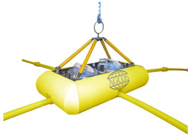
Figure 3. Marine EM receiver for transition zones exploration; 2-channel SMMT system.

To make the marine system relatively lightweight and environmentally friendly, a custom deploy and retrieve system was implemented. The SMMT has two quick access pressure vessels for electronics and the power source, which simplify the operation on the vessel's deck and increase productivity.