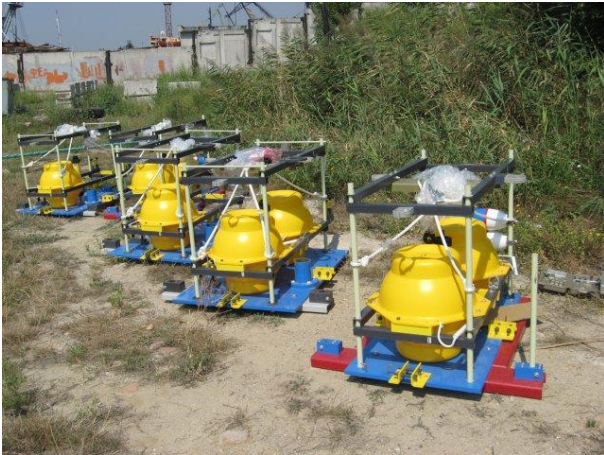
Figure 2. Onshore preparations for the deployment of the coastal shelf marine EM receivers.

Figure 2 shows several 2AUSS-07A systems before loading onto the vessel. Telescopic booms are kept separately to minimize required storage space for the systems on deck and to simplify transportation procedures.